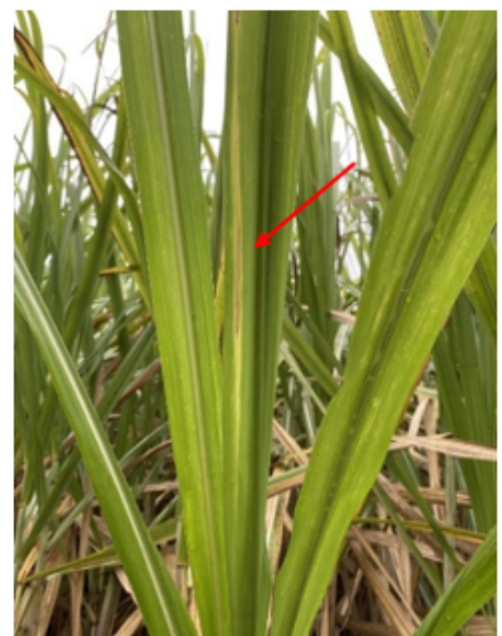
Chlorotic streak symptoms (arrow) in SRA26