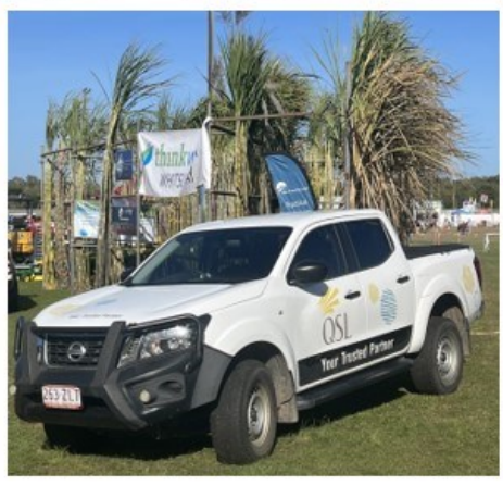
QSL proudly on display at the Show Cane exhibition.