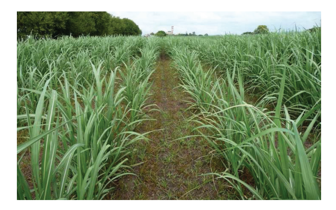
Photo 4: Delaying treatment for 8 weeks after planting resulted in even higher yield losses.